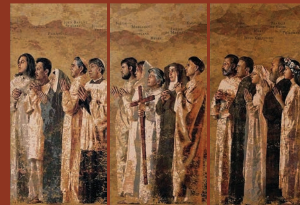
Cover: The Assumption of the Virgin by Bergognone (The Met Museum, New York); above: Communion of Saints by John Nava (The Cathedral of Our Lady of the Angels, Los Angeles)

LIVING JESUS includes artwork to stir the mind and the soul. Also within LIVING JESUS you will find prayers drawn from the prayer of the Church and pages for children.