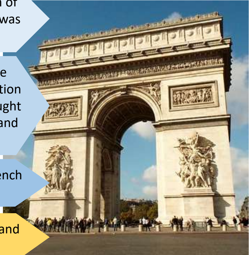
Photo courtesy of (@flickr.com) - granted under creative commons licence – attribution

It is 50 metres tall, 45 metres wide and 22 metres deep.