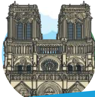
Notre Dame Cathedral