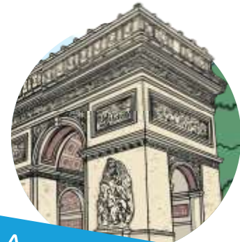
Arc de Triomphe