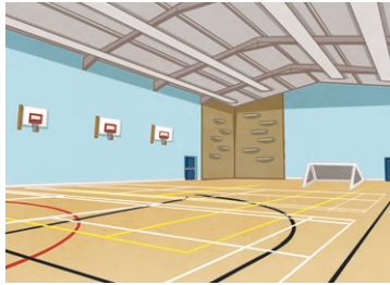
le centre de loisirs (m) leisure centre