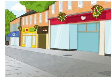
la ville (f) town