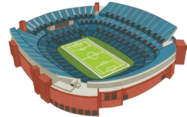
le stade (m) stadium