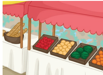
le marché (m) market