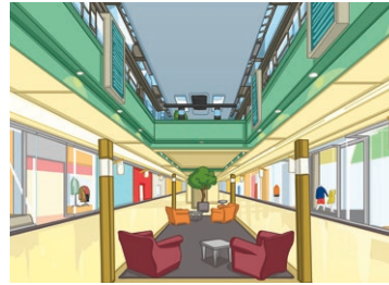
le centre commercial (m) shopping centre