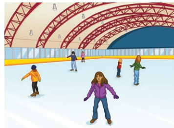
la patinoire (f) ice rink