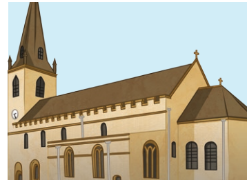
l'église (f) church