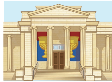
le musée (m) museum