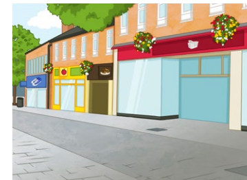
les magasins (pl) shops