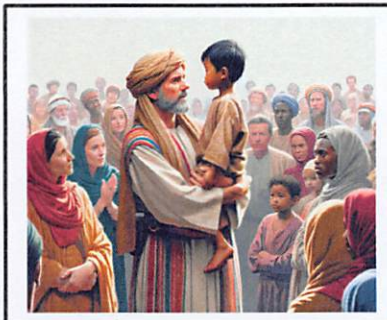
Our Lady of Sorrows